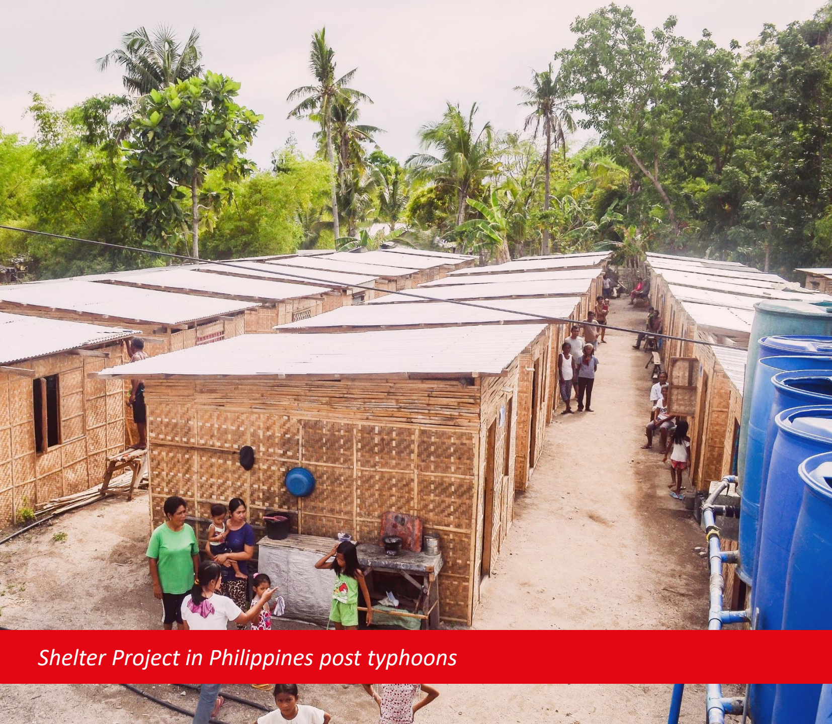
Shelter Project in Philippines post typhoons