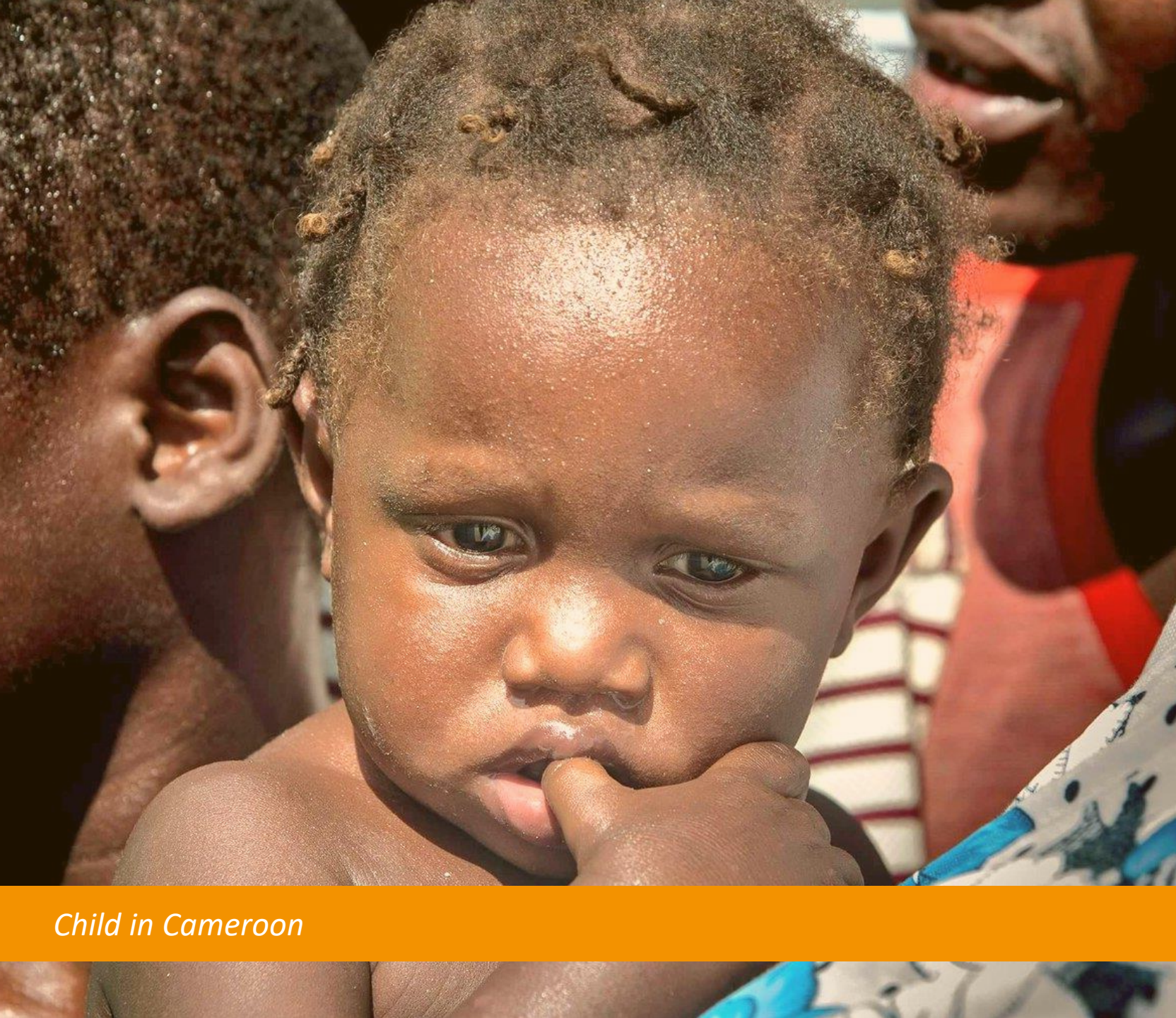
Child in Cameroon