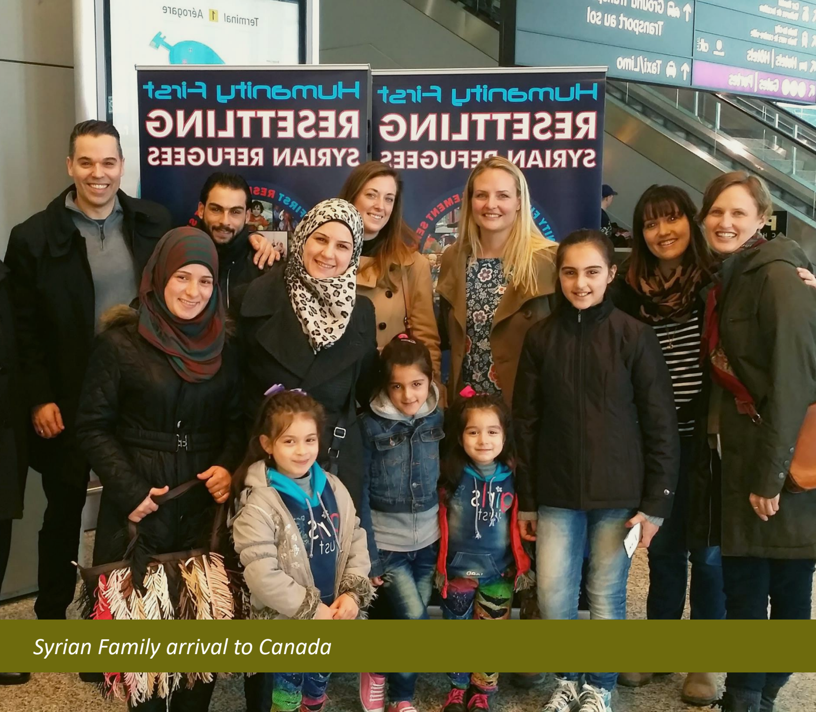
Syrian Family arrival to Canada