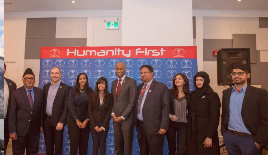
Shelter Bus team