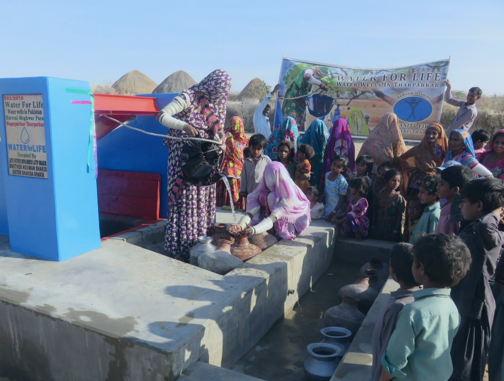
Water Well built in Pakistan