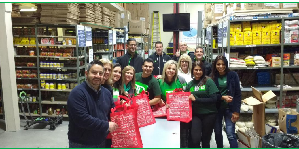
TD Canada Trust Bank Volunteers helping sort food at Humanity First Foodbank

cannot reach the Food Bank due to physical disability or lack of available transport, including seniors, single parents, students, individuals in severe financial distress.