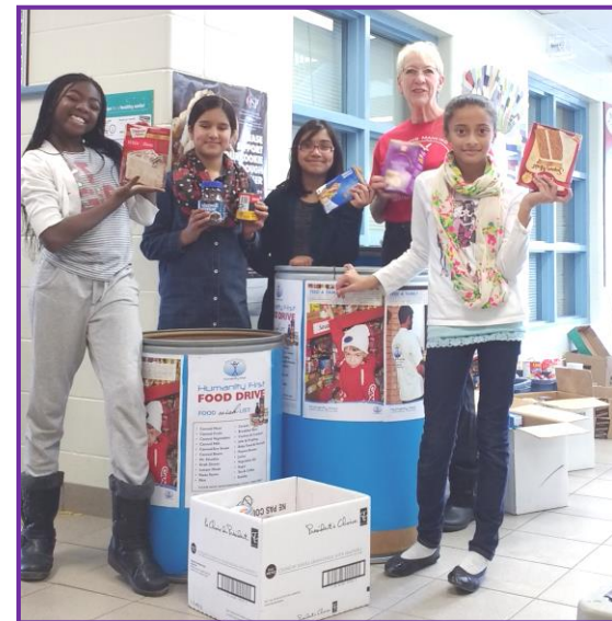
Student & Staff at Discover Public School collect Food Humanity First Foodbank