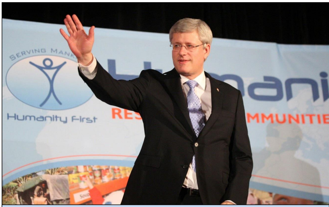
Honorable Steven Harper Prime Minister of Canada attended the Fundraising Event in December 2014