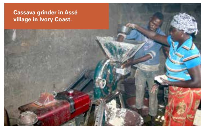
Cassava grinder in Assé village in Ivory Coast.

HF has deployed crop processing plants to villagers in The Gambia, Ivory Coast, Liberia and Uganda to good effect for crops such as Cous, Maize, Rice and most commonly Cassava.