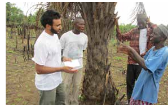
Left: Our HF rep in Sierra Leone helping local farmers on agriculture projects.

HF has deployed crop processing plants to villagers in The Gambia, Ivory Coast, Liberia and Uganda to good effect for crops such as Cous, Maize, Rice and most commonly Cassava.