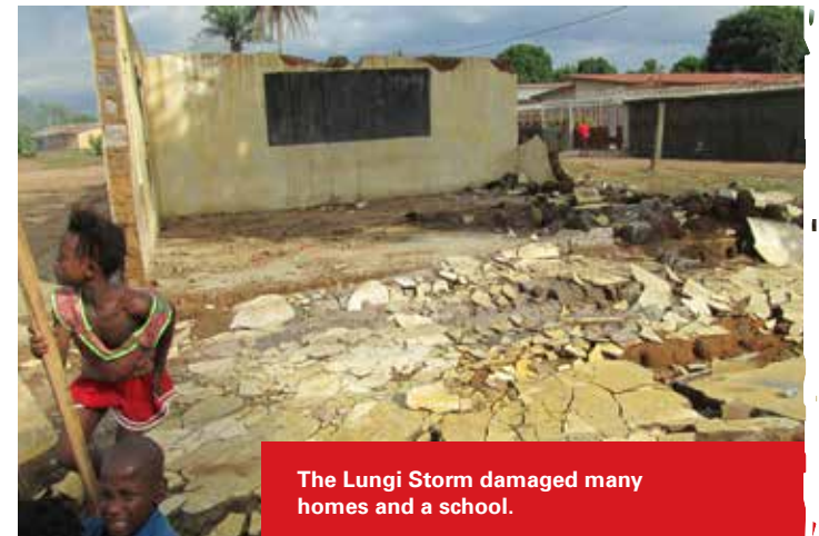
The Lungi Storm damaged many homes and a school.

Freak storms in southern Sierra Leone damaged many homes and buildings including the primary school in Lungi. HF worked with the local team over several months to rebuild the school.