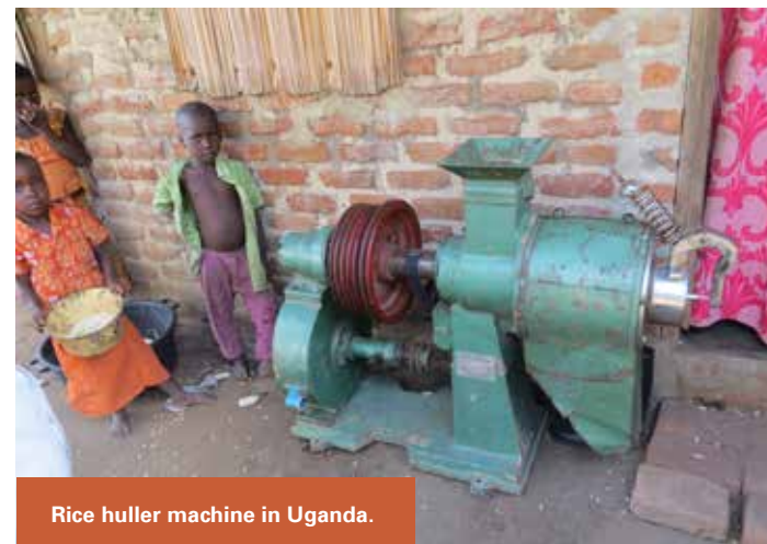
Rice huller machine in Uganda.

In Europe and North America, we continue to see the effects of the financial crisis among low paid workers, and our growing food banks are in demand. Our largest food bank serving Greater Toronto in Canada is open 6 days a week and provides food hampers delivered to the door for over 7,000 people. We began our first UK food bank in London, and now also have 5 food pantries running in the USA in Willingboro (NJ), Harrisburg (PA), Dayton (OH), Silicon Valley (CA) and Seattle (WA).