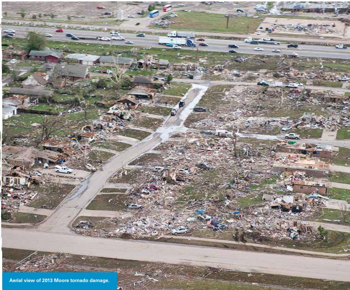
Aerial view of 2013 Moore tornado damage.

Post-Disaster activities included outreach to victims including phone calls, emails and giving out $10,000 in gift cards. Status update calls/emails to families affected by Sandy every 2-3 weeks.