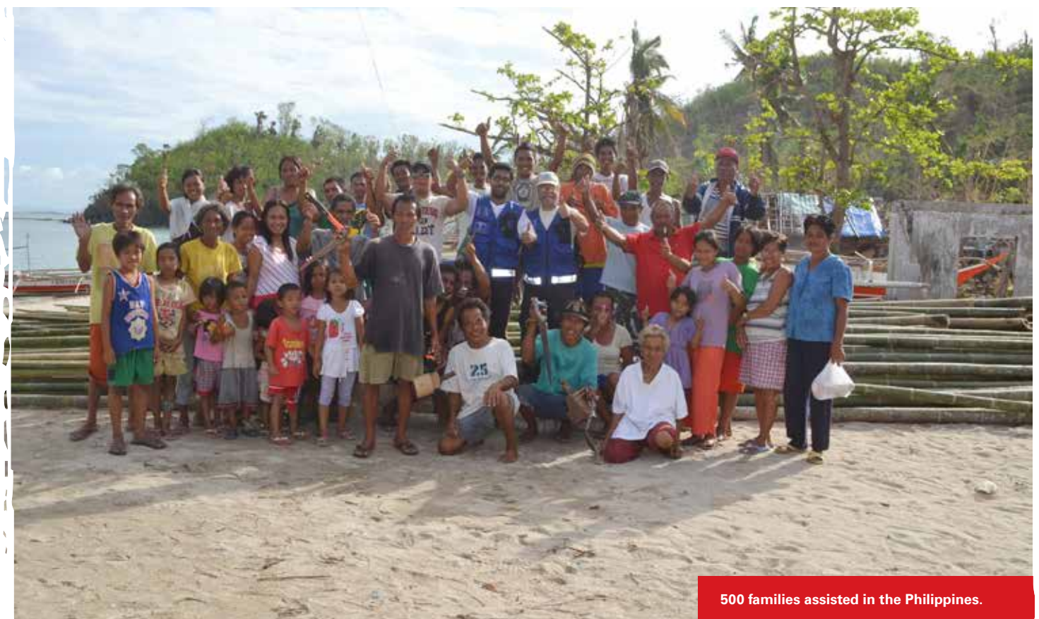
500 families assisted in the Philippines.